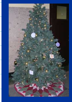
The Jesse Tree

In mid-December the entire school performs at the annual Christmas concert and Living Nativity. This year family and friends, from near and far, will come to Sacred Heart Church on Thursday, December 10 th at 7:00 p.m. to hear the beautiful voices of our students. The evening will end with our sixth grade class performing the First Nativity. This event is a beautiful way to celebrate the season.